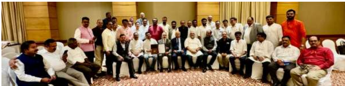
Team AISBOF with IBA Officials after the signing of 09 th Joint Note